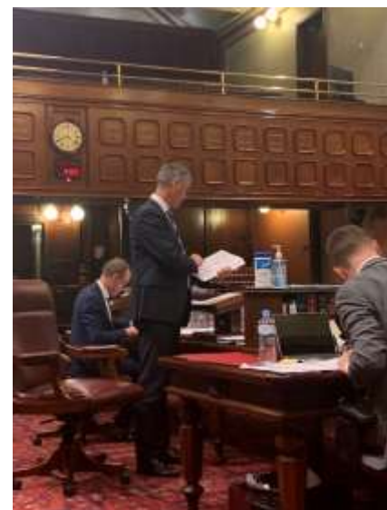
The MSA is passed again, 19/11/2021

There is still more to be done, but this victory is definitely worth celebrating!